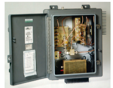
The TXRX Systems Signal Booster II

Please go to http://www.bird-technologies.com/ for additional information. Ω