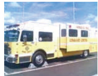
Honolulu Fire Command Vehicle

This offering is not to compete with robust public safety consoles, it is intended for Incident Command and Tactical Interoperability. Ω