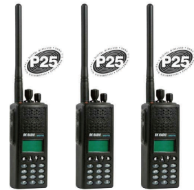
Relm Wireless P150, P400 and P700/800

watts RF output power, 512 channels of dynamic programming, Type 3/Level 1 encryption security, USB Flash and cloning technology, 100 programmable Quick call IDs, Channel/Priority/Group Scan, Talk around & Problem prevention features. Check out our website at www.relmwireless.com and look for the BK KNG radio the next time you need the very best radio for your application. Ω