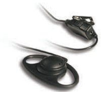
Otto Communications "D" Earhanger

Or give me a call for more information and pricing. Ω