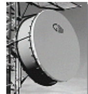
8' High Performance Dish with Radome

As always, you can call me for additional information and technical questions. Ω