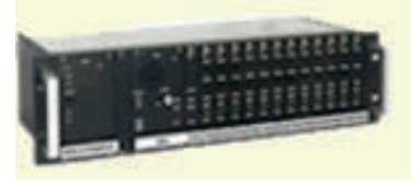
SNV-12 Voter Chassis Full Of Modules

Commands have been added to report the system statistics and configuration parameters in comma separated values (CSV) format, report the IP configuration, and access the realtime clock. Ω