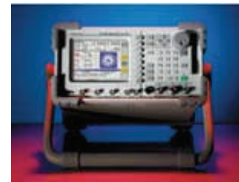
Aeroflex 3920 Next Generation Test Set

The 3920 also provides new capabilities to export files to USB drives and connect external USB input devices and extended audio input ranges for measuring and analyzing audio signals with extended range inputs of up to 30 Volts rms. Now you can analyze high level audio signals for AF Frequency, AF Level, SINAD, Distortion, Hum and Noise and Signal to Noise Ratio.